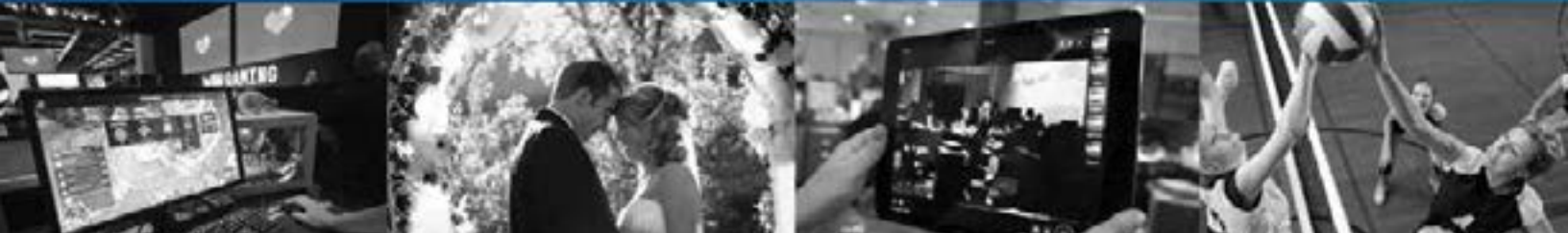
Education / Gaming